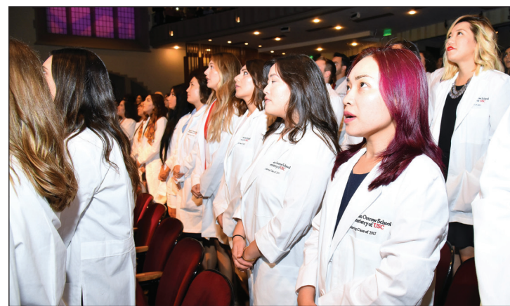
On Aug. 25 at the Health Sciences Campus, 232 Trojan occupational therapy graduate students — who hail from 20 states and 16 nations and who collectively hold undergraduate degrees in more than 50 majors — pledged their commitment to the values and ideals of the health and wellness profession during the USC Mrs. T.H. Chan Division of Occupational Science and Occupational Therapy's 2017 White Coat Ceremony.