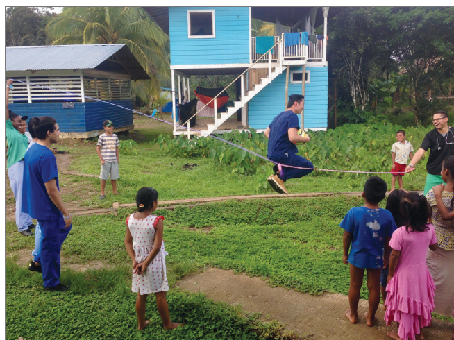
Recipients of the Dhablania and Kim Family Global Medicine Fellowship play jump rope with residents during a recent research trip to Panama.