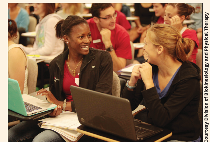
Aspiring physical therapists now have a new online and on-campus hybrid program to obtain a Doctor of Physical Therapy degree.

The first class of master's degree students with a sports science emphasis will begin officially in fall 2018.