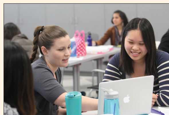
Two new courses offered by the USC Chan Division of Occupational Science and Occupational Therapy target undergraduate students and are designed to help these Trojans thrive throughout their late teenage years and into their early 20s.

Through experiential learning activities, students analyze their personal experiences, reflect upon the significant challenges posed during emerging adulthood, and learn about occupational therapy-based approaches to better prepare themselves to successfully manage these challenges.