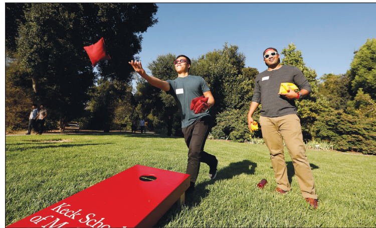
The reception, held Aug. 8 in San Marino, included a variety of games and activities, as well as a photo booth.