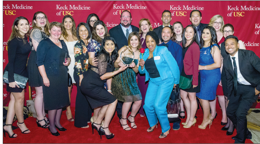
Members of the USC Verdugo Hills Hospital Emergency Department celebrate after being awarded the Choi Family Award for Patient-Centered Care.