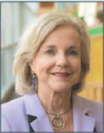
Children’s Hospital Los Angeles