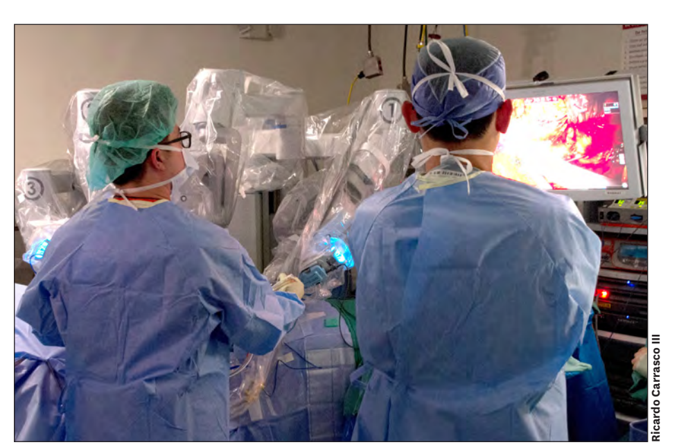
The medical team watches a monitor during a robot-assisted paraspinal tumor resection at Keck Medical Center of USC.