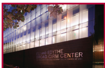
The Broad building is the first building on the Health Sciences Campus to receive a silver Leadership in Energy and Environmental Design (LEED) designation based on its unique, eco-friendly features.

The Eli and Edythe Broad CIRM Center for Regenerative Medicine and Stem Cell Research at USC received high honors from R&D Magazine as the publication announced its 2011 “Laboratory of the Year” winners. Featuring architecture and interior design by ZGF Architects LLP of Los Angeles, the building is one of only four