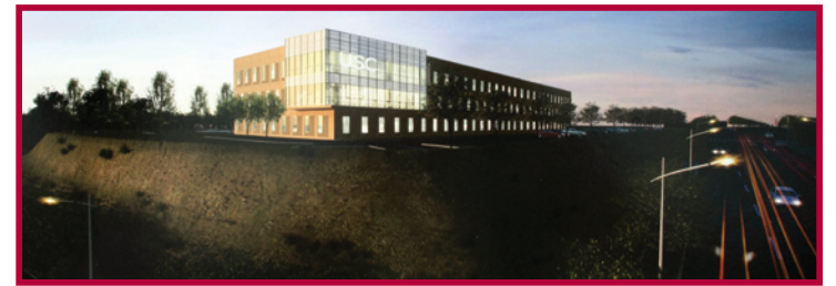
Above, an architectural rendering shows the Soto Street Building, expected to be completed in late 2011.

USC faculty can attend free of charge by registering at http://tinyurl.com/29s57nn and using code "USCF" at checkout. Free registration ends at 6 p.m. Oct. 1.