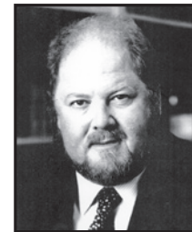
James E. Rothman

Cell Biology at Yale University Medical School, will speak on "Mechanism and Regulation of Membrane Fusion."