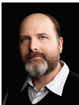
W. Daniel Hillis

Noted technology innovator and entrepreneur W. Daniel Hillis, research professor of engineering at the USC Viterbi School of Engineering and professor of research medicine at the Keck School of Medicine of USC, is the principal investigator for the effort.