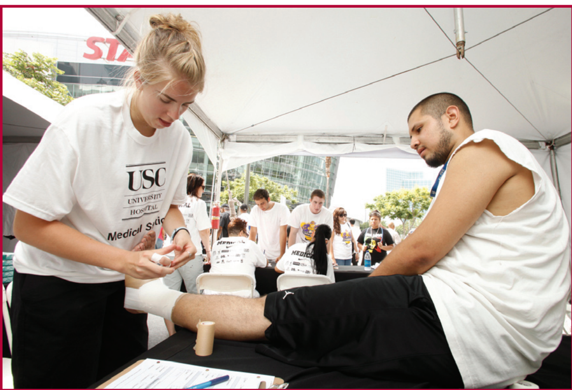
PLAYING IT SAFE —USC nurses and residents tended to participants at the Lakers 3 on 3 Basketball Tournament on Aug. 15 and 16 at the USC University Hospital-sponsored medical station. Many tournament players stopped by the booth to have ankles and wrists taped, and to be treated for minor scrapes and dehydration.