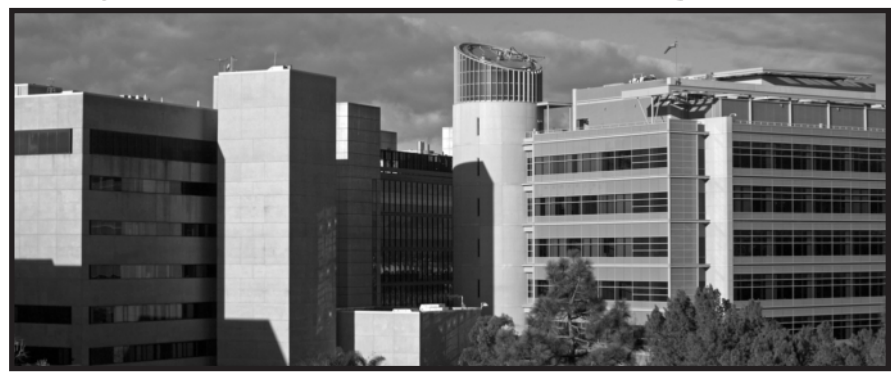
The agreement includes USC's acquisition of the USC Norris Cancer Hospital.

This agreement will resolve the pending legal action.