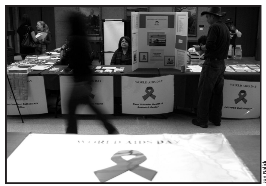
RAISING AWARENESS, FIGHTING AIDS —Commemorating World AIDS Day a day early, campus groups set up information booths on the first floor of the Keith Administration Building on Nov. 30. The annual event is dedicated to raising awareness of the AIDS pandemic caused by the spread of HIV infection.