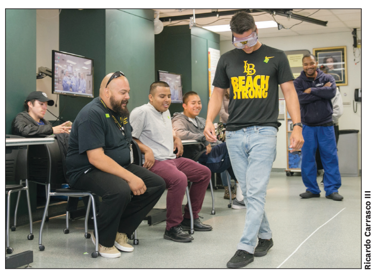
A high school student participates in a simulation wearing "beer goggles" during a Sept. 25 visit to Keck Medical Center of USC.

The afternoon was an intense one: The SEA students started with a presentation on the cost — financial and human — of