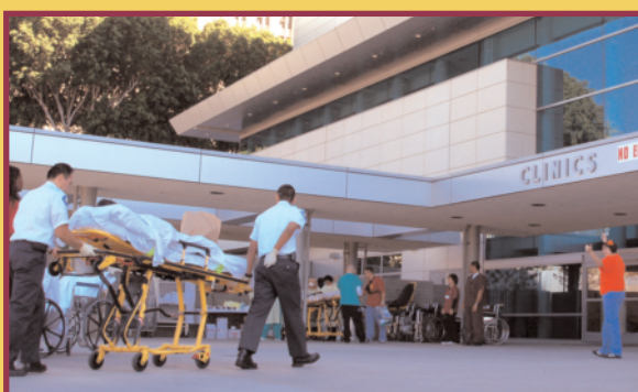
Staff and volunteers guide patients from ambulances into the new LAC+USC Medical Center on Nov. 7.